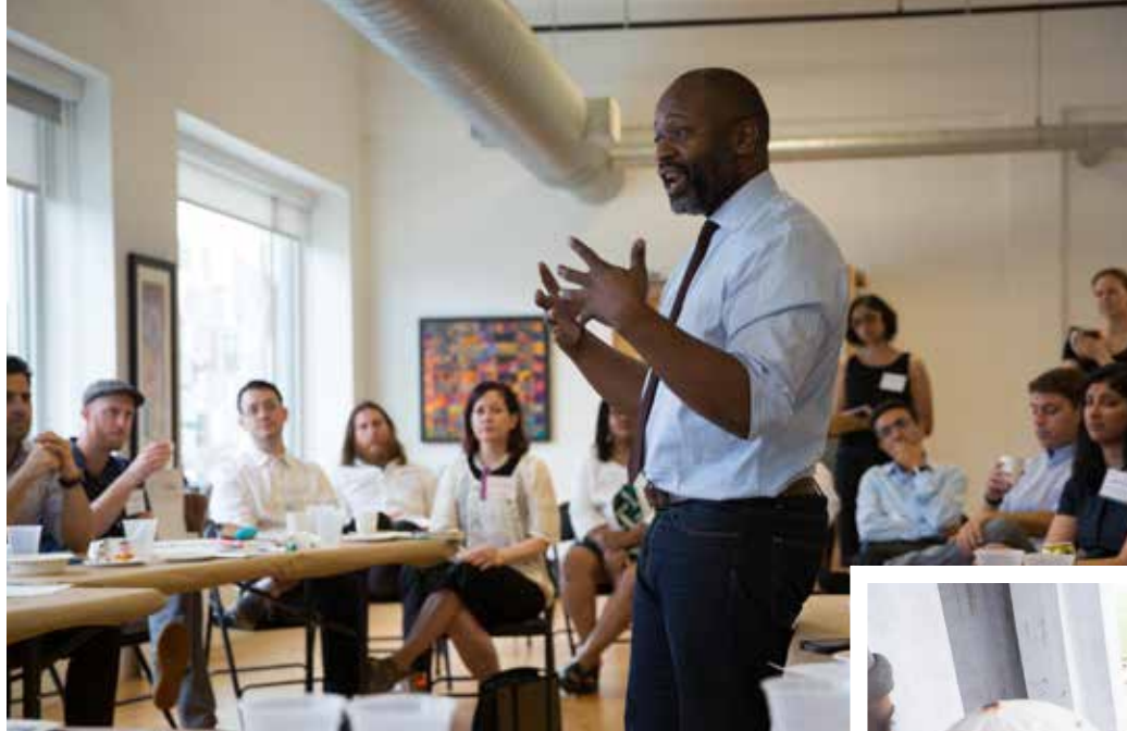
▲ Place Lab, a joint enterprise of Harris and the University's Arts + Public Life initiative led by renowned artist Theaster Gates, is dedicated to fostering a fundamental shift in urban development policies through immersive arts and culture transformations.

Whatever your passion, we'll guide you toward impact. Harris Public Policy offers several master's and joint degree programs, as well as a doctoral program designed for an academic or research-oriented career. We also offer several certificate programs to allow students to specialize in a particular area of inquiry, an executive training program, and a non-degree Graduate-Student-at-Large program with credit transferable to degree-granting programs.