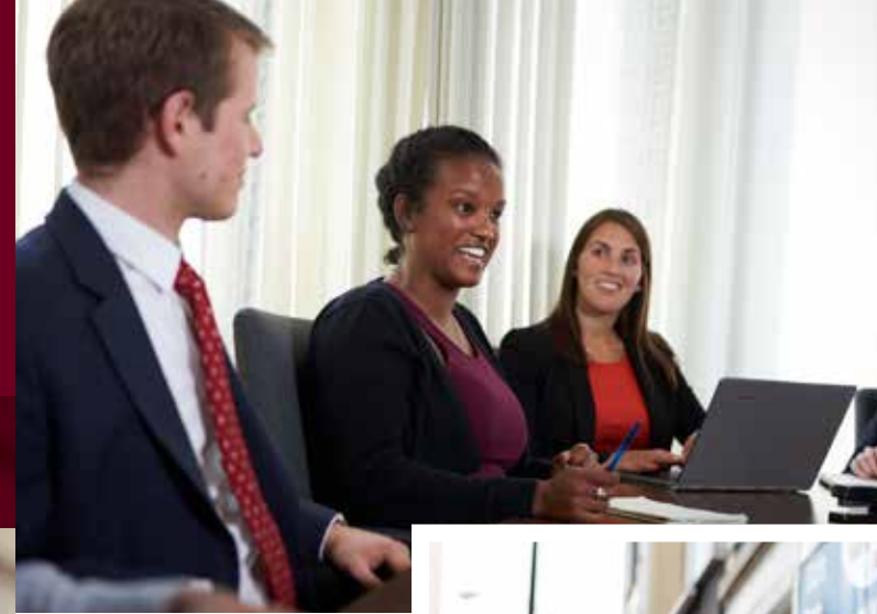
← Harris students in the Mayoral Fellowship Program gain hands-on experience in municipal policymaking at Chicago's City Hall.

It takes fearless questioning of conventional wisdom. It takes facing the facts—gathering data on how things are —to make things better . At Harris Public Policy, we teach you how to make a measurable social impact by developing solutions for society that work.