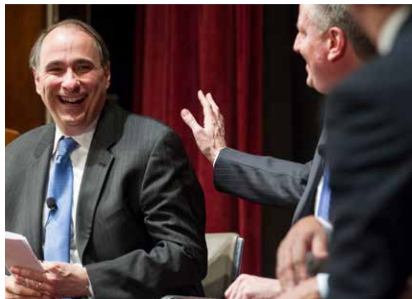
▶ Harris Distinguished Senior Fellow David Axelrod is a 35-year veteran of American politics and journalism and leads the University's Institute of Politics.

Harris's Career Development Office has close relationships with many local, national, and global businesses and institutions, granting students access to exceptional resources. As part of our Mentor Program, every Harris student is paired with a successful professional, often a Harris graduate, on the basis of interests, location, employment sector, and career goals. Through internships and experiential learning in our community and throughout Chicago, you'll apply your skills from courses to real-world issues in the field. By creating impact right here in Chicago, you'll learn the methods that empower you to face the world's toughest problems.